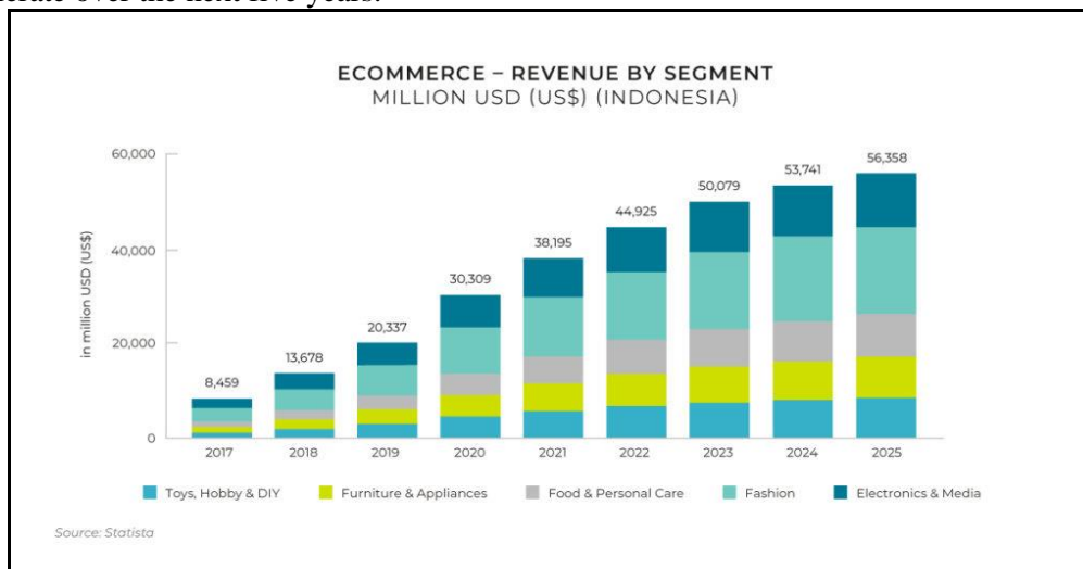
Figure 3. E-Commerce Revenue by Segment

Total e-commerce sales throughout all product types are currently $38 billion, with a projected increase to $56 billion by 2025. With a market share of $12.5 billion, fashion is currently the largest product category. Electronics and media rank second with $8 billion in revenue. Fashion remains the market leader in 2025, with a value of US$18 billion. Electronics and media might expand as well, hitting $11.7 billion (Dixon 2022). Growth is projected to continue in the next few years, according to estimates. The growth of e-commerce is expected to accelerate over the next five years.